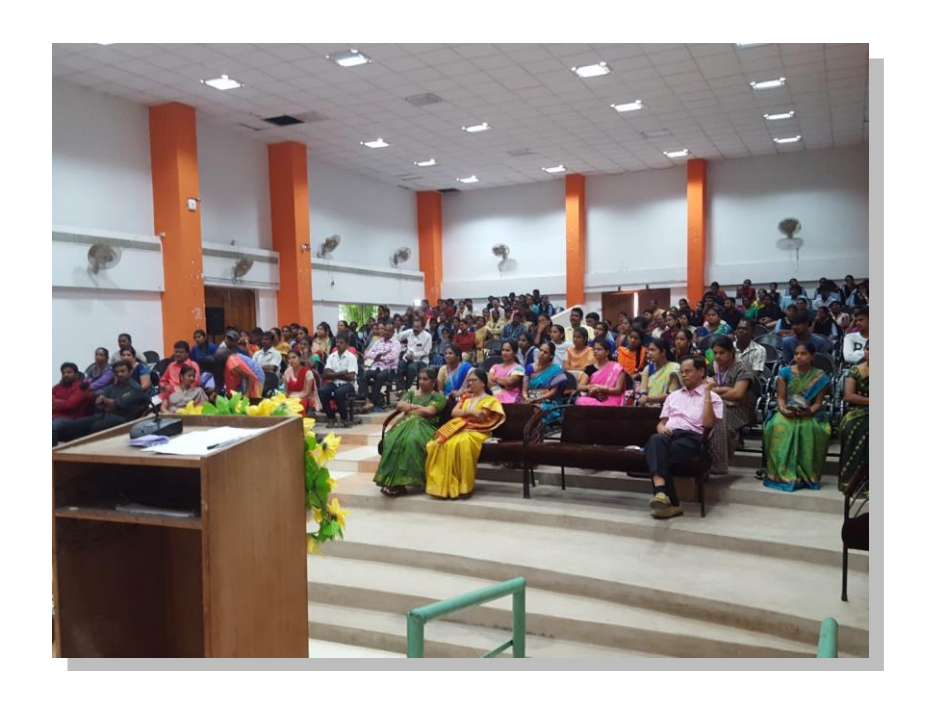
Students and faulty members gathered at orientation program